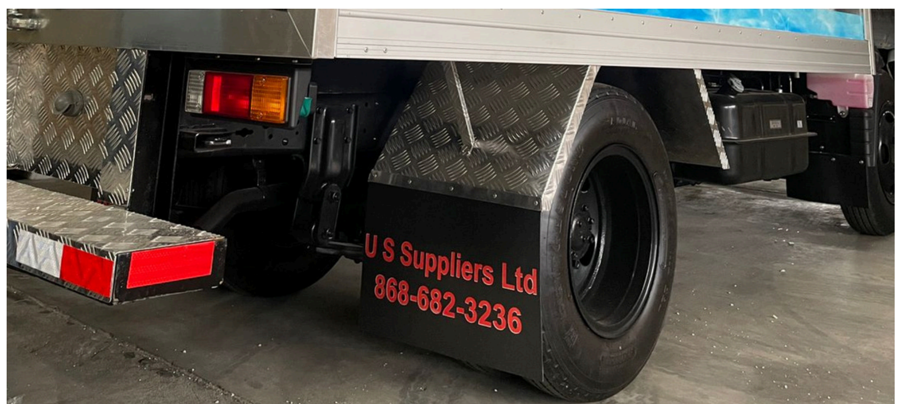
Refrigerated Truck Bodies