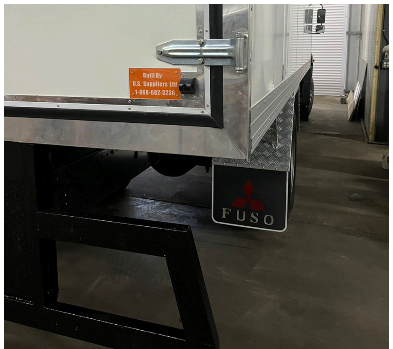
Refrigerated Truck Bodies