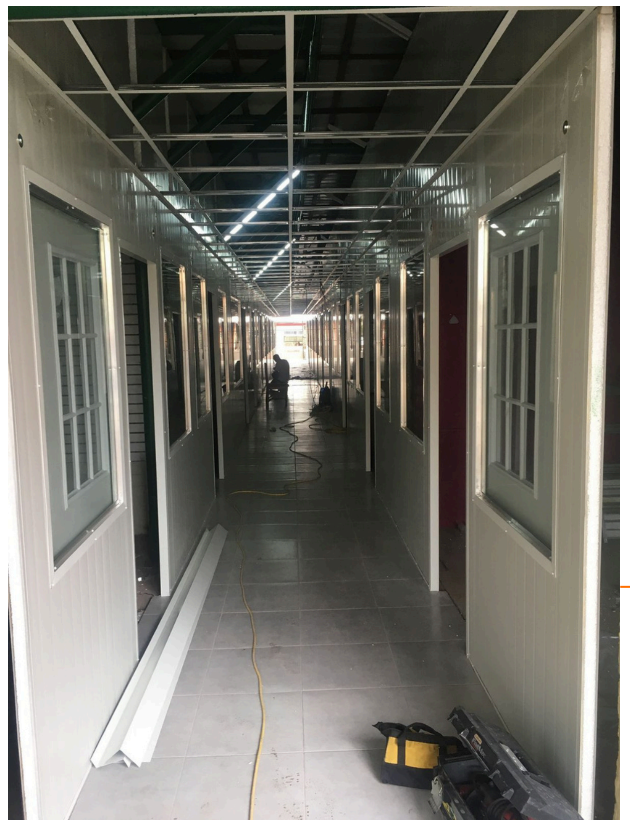
Pre-Fab Offices / Buildings